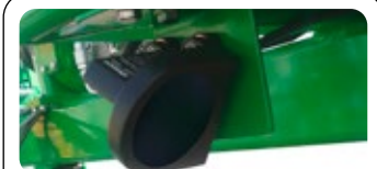
Increase in price for command radar in electric sowing