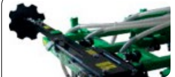
Hydraulic tracer set (Discos dentados)