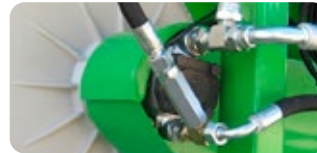
Hydraulic transmission difference (tractor oil)