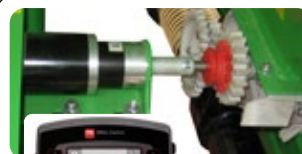
Planting electric control