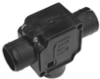
Close independent outputs folding parts