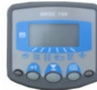
Increment for electronic controller with 5 functions: