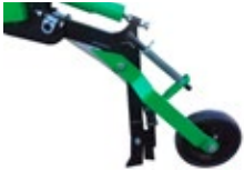
Kit of compactor wheel for SDR arm (Price per arm)