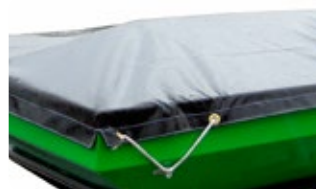
Cover for SVM fertilizer spreader