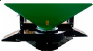
Double fertilizer orientator SVM.